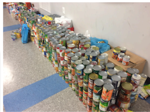
Eagle students held a food drive for the food pantry.